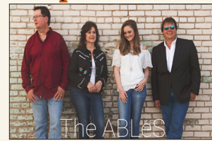
The ABLeS 6-7p.m