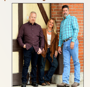
Country Rewind 6-7:30 p.m.

Bill's Xtreme Laser Tag & Gaming Trailer • 2-6 p.m. Armbands available in picnic building.