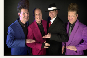
The Benders 7:30-9 p.m.