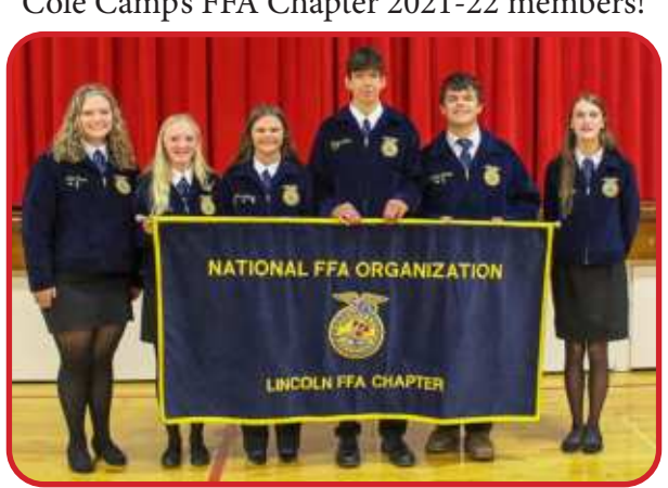
Lincoln's 2021 Chapter FFA Degree recipients!