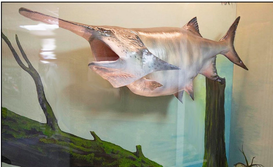
AN ANCIENT FISH WITH A LARGE FOLLOWING, the spoonbill is the oldest surviving species in North American, dating back more than 125 million years. Spoonbill season gets underway March 15.

The world record was caught in 2021 in Key-