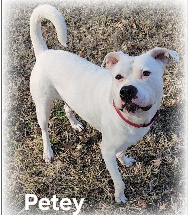
Petey 1307 N Washington St., Clinton, MO Mon thru Fri 2pm to 6pm Sat noon to 4pm.

Meet Petey-This 3.5 to 4 year old boy has a huge heart and a zest for life. He is getting sad in the shelter so a forever home soon would be wonderful. He is very friendly with everyone, knows how to sit, keeps his kennel perfectly clean, loves to run so a fenced yard would be best and he is very handsome! Petey wouldn't mind being an only pet to have all of your love. For more details or to meet Petey call the Clinton Animal Shelter 660-885-7999.