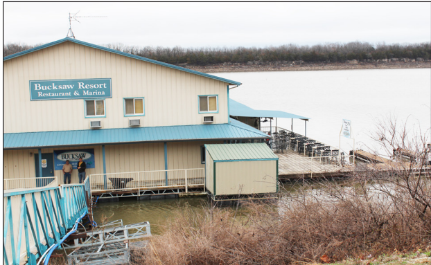
SEATING ON THE DECK offers a view of Truman Lake and boats moored at the dock.