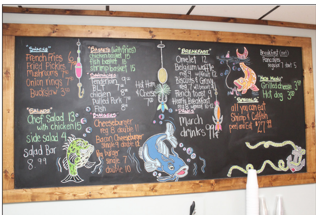
THE MENU features catfish and shrimp, cheeseburgers and pork tenderloin sandwiches.