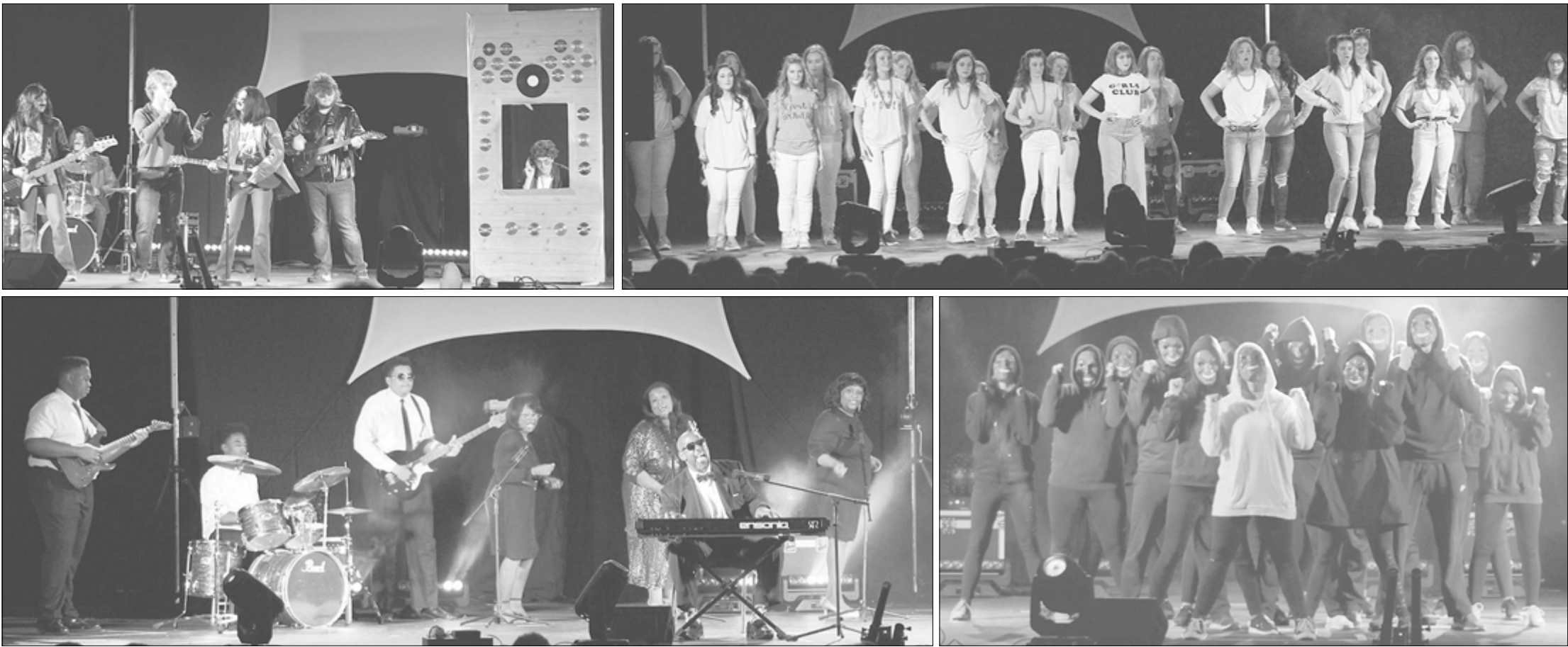
Top Left, More Cowbell. Top Right, Who Run The World. Above Left, Ray Charles. Above Right, Purge. Below Left, Walk This Way. Below Right, Pitch Perfect.