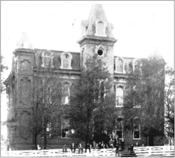
McTyre School was McKenzie's first educational institution, coming to McKenzie from Caledonia in 1867 before there was a public school and before Bethel College moved from McLemoresville in 1872.