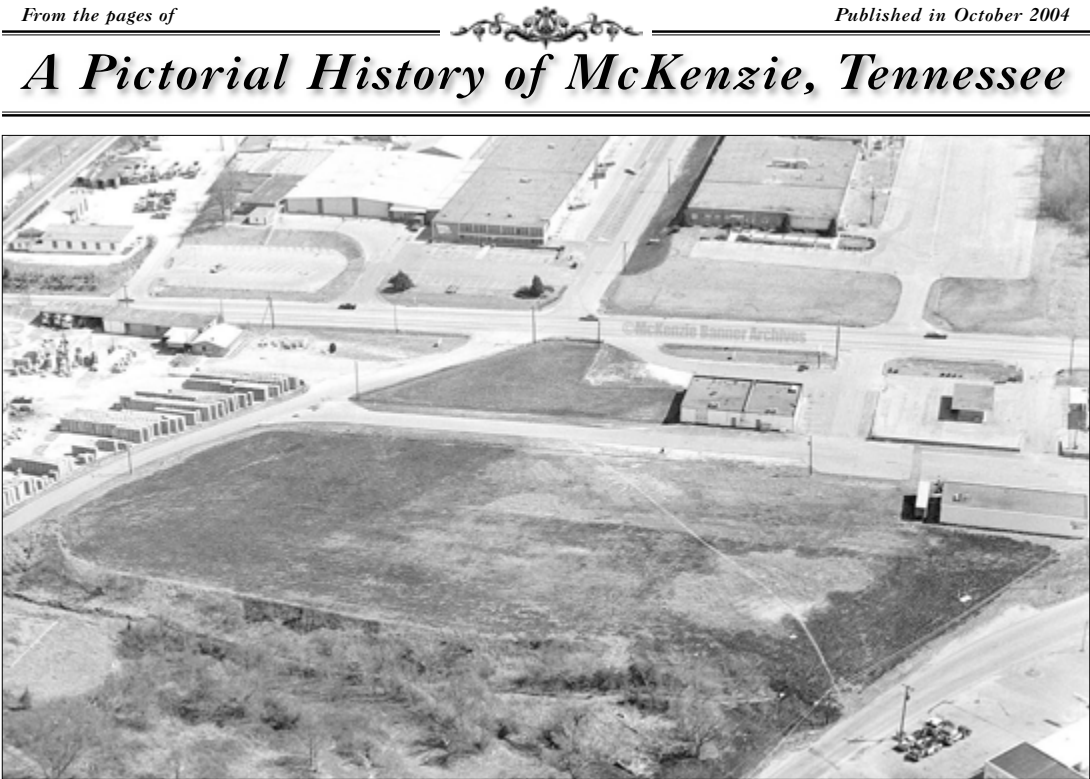
Aerial photo of Hwy. 79 showing Gaines and Brown Shoe Companies, 1960s. File photo originally published in "A Pictorial History of McKenzie, Tennessee," by The McKenzie Banner in October 2004.