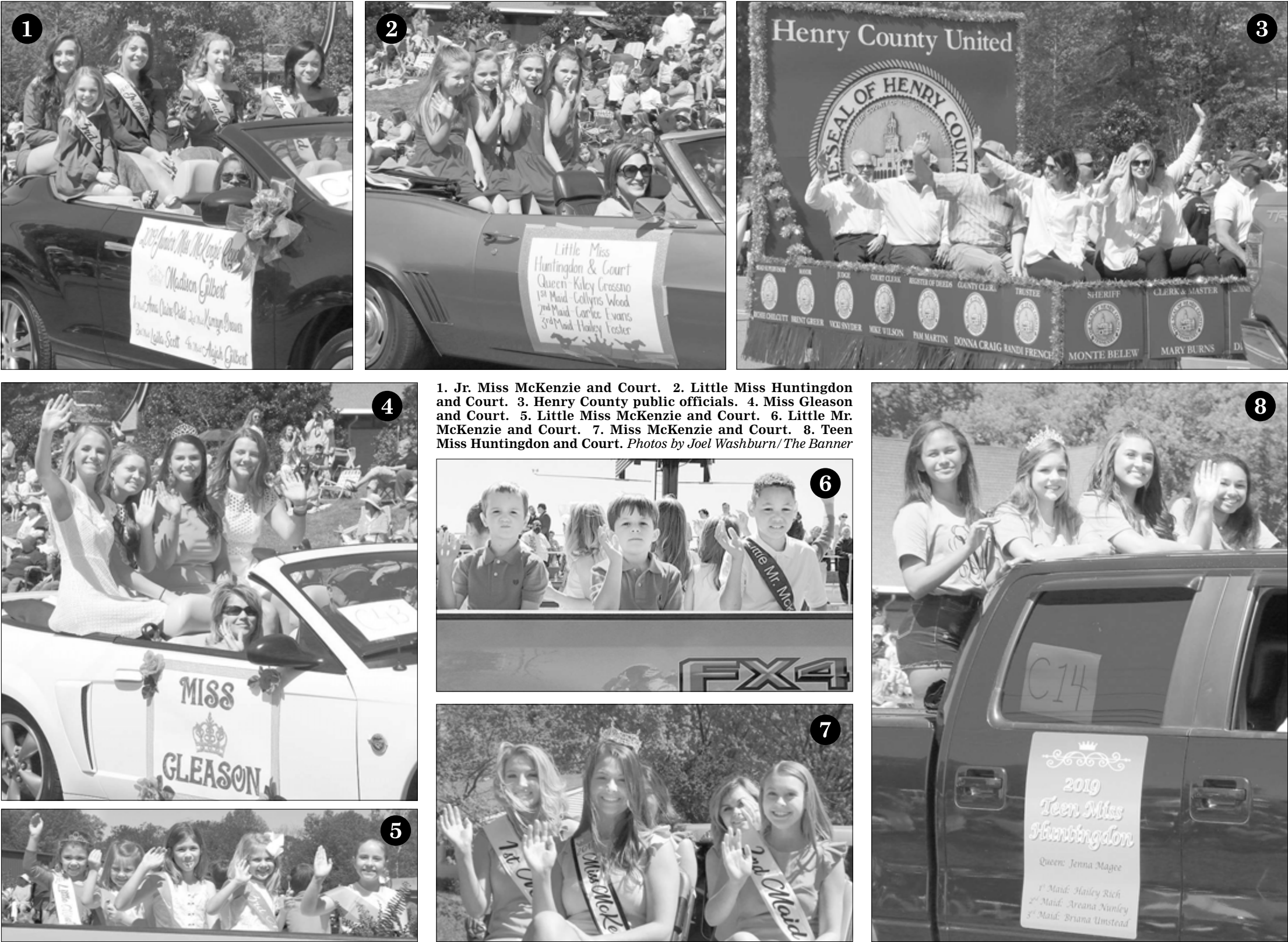
1. Jr. Miss McKenzie and Court. 2. Little Miss Huntingdon and Court. 3. Henry County public officials. 4. Miss Gleason and Court. 5. Little Miss McKenzie and Court. 6. Little Mr. McKenzie and Court. 7. Miss McKenzie and Court. 8. Teen Miss Huntingdon and Court.