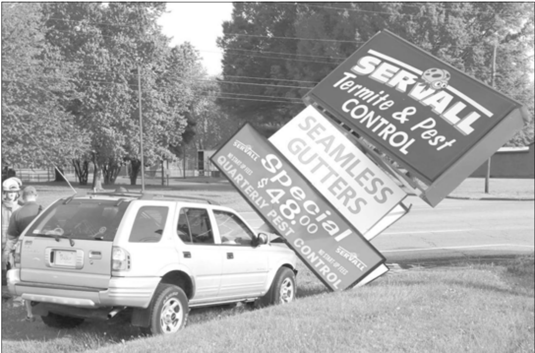
The Servall sign was tumbled as a motorist left U.S. 79 and struck the sign at the intersection of Grandberry and Highland (U.S. 79) in McKenzie. McKenzie Police and Fire, and Baptist Ambulance Service responded to the scene at around 7:30 a.m. Monday.