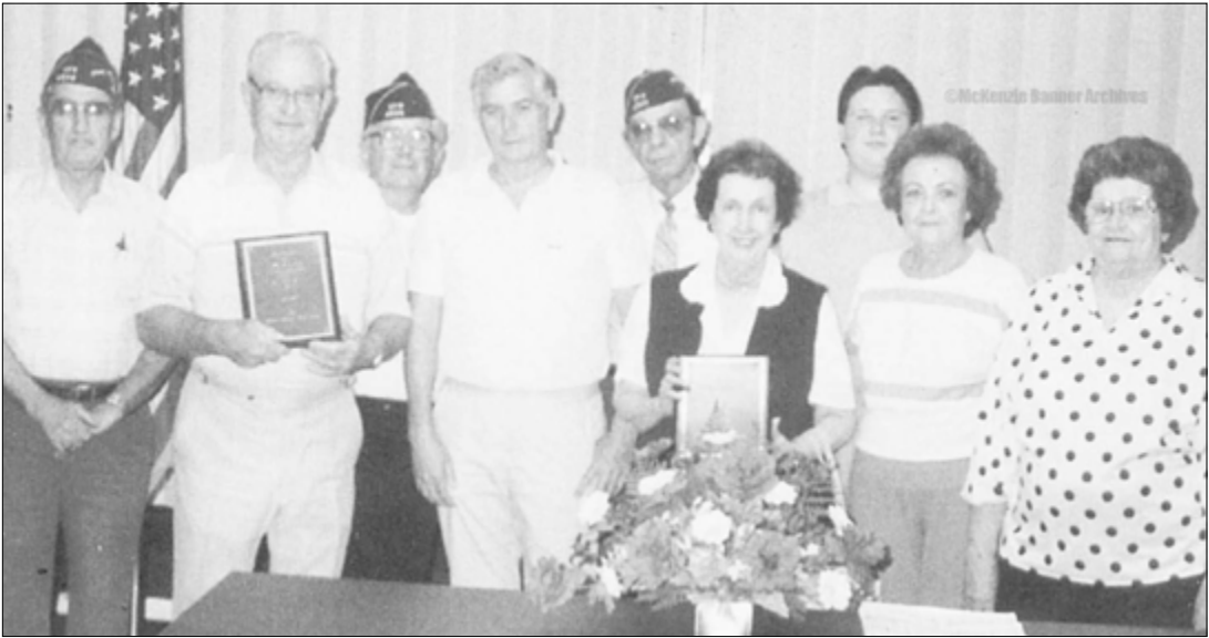
The McKenzie VFW and Ladies Auxiliary support many charitable causes in our community. Shown are some of the members, late 1980s. File photo originally published in "A Pictorial History of McKenzie, Tennessee," by The McKenzie Banner in October 2004.