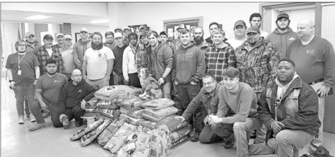
Tennessee College of Applied Technology in McKenzie held a Pet Food Drive to help the Carroll County Humane Society. All programs were encouraged to participate with the incentive of the winning program receiving donuts. Students collected over 16,000 ounces of pet food/ supplies. The Heating, Ventilation, and Air Conditioning (HVAC) program won by collecting 379 ounces per student. TCAT McKenzie adopted the #smallschoolbigheart a few years ago due to its students always being willing to support their local community and school activities. TCAT may be the small technical school on top of the hill, but its staff attempt to make a big change in the students and the community. For more information about the programs offered at TCAT McKenzie, call 731-352-5364. New classes begin January 6th, 2020.