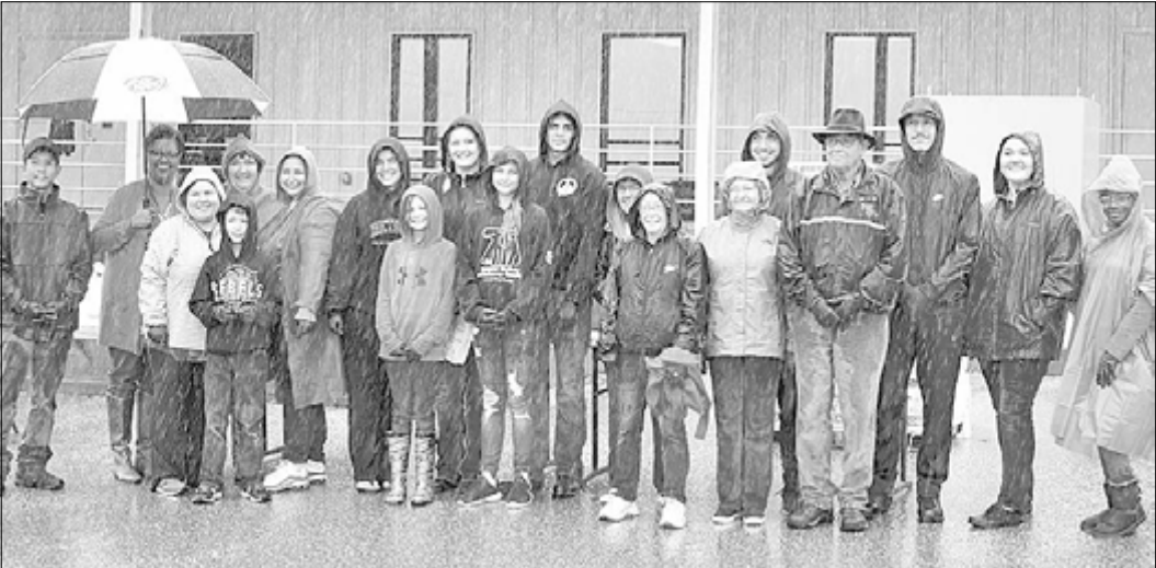
McKENZIE (October 30) — McKenzie Medical Center partnered with Catholic Charities of West Tennessee and the Mid-South Food Bank to provide a free commodity food distribution Wednesday at the medical center. Volunteers from the medical center, Bethel University, local churches, homeschool students and others worked for hours in cold, heavy rain to provide food for over 300 families.