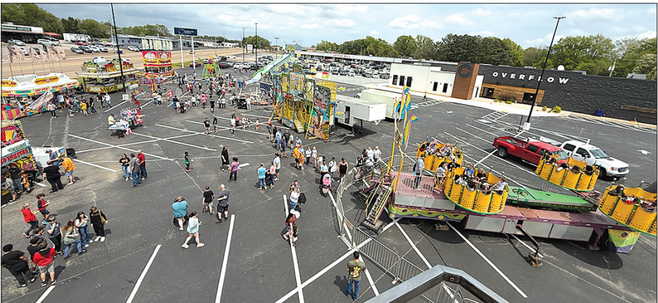
The view from the ferris wheel of Overflow Church's Easter Community Carnival.