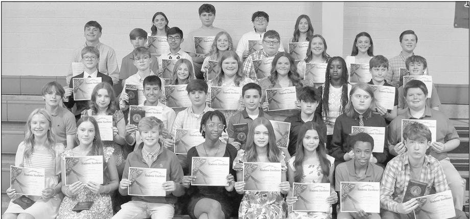
Above Left, Eighth grade honor students. Above Right, Seventh grade honor students. Below Left, Sixth grade honor students. Below Right, Fifth grade honor students.