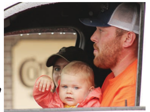
5H Enterprises LLC had this cute helper to wave at those watching the parade this past Saturday in Pisgah.

Along with the obvious fun you could also see and hear the joy of everyone gathered, happy to be together once again for the fun event. Despite being small, the town of Pisgah showed they know how to play and have a good time.