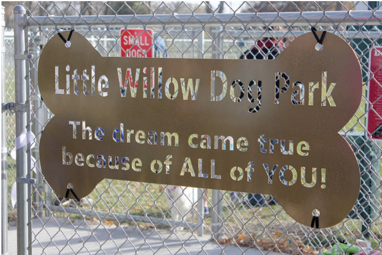
The Little Willow Dog Park sign on the front gate of the facility.