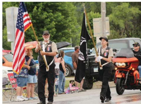
Despite the rain Pisgah Play Days went on this past Saturday. The fun started with a parade.