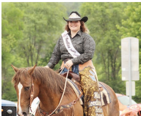
The Woodbine Rodeo Queen made an appearance at the Pisgah Play Days Parade, looking fabulous and had all the children excited to see her.