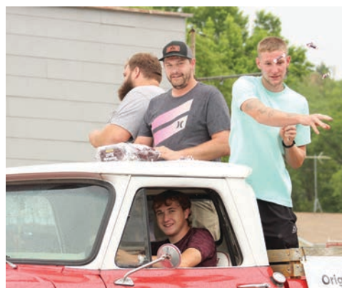
Volunteers for Mo Valley Rally days also helped to make the parade fun while reminding everyone that the rally days will be the 17th and 18th of September.