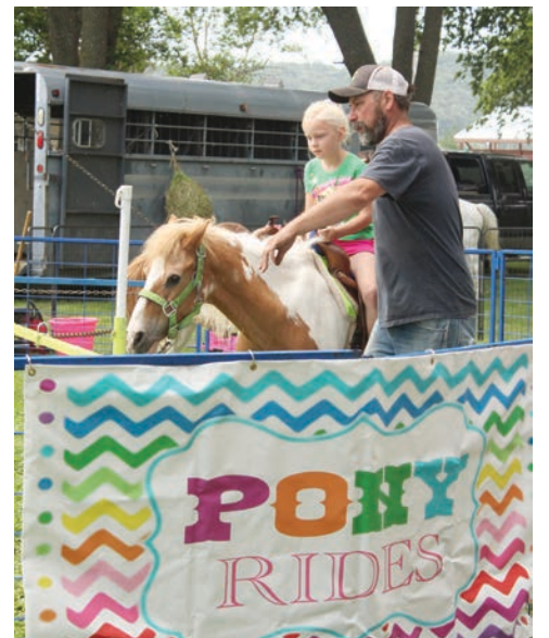
Pony rides were among the many fun events happening in Pisgah.