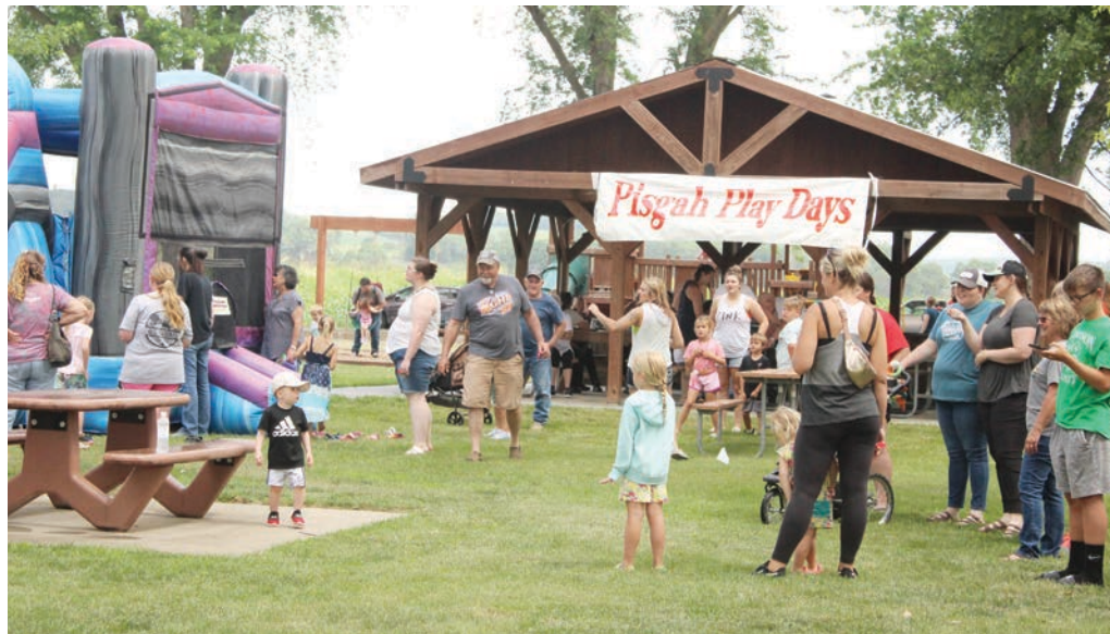
The park in Pisgah was packed with people playing and having fun this past Saturday.