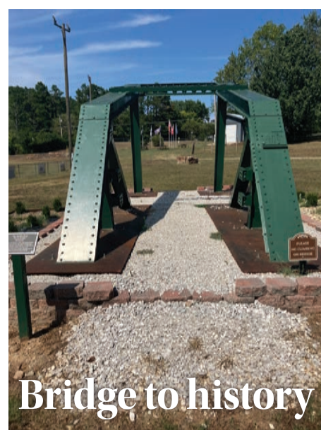
Bridge to history

A memorial to the old Pruitt Bridge is located at Bradley Park in Jasper. Girders from the old bridge on Highway 7 were donated to the city of Jasper and to the the Newton County Historical Society to create a memorial. The original bridge was destroyed in June of 2021. The monument was erected in 2024.