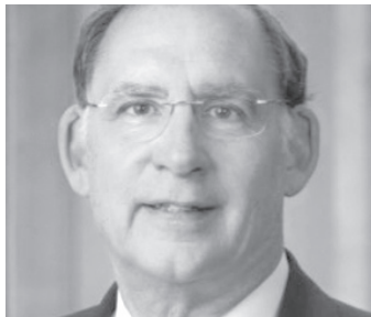
JOHN BOOZMAN U.S. SENATOR

Additionally, legislation I championed to expand the External Provider Scheduling Program (EPS) to reduce the time nec-