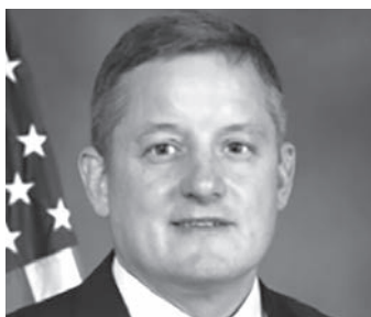
BRUCE WESTERMAN U.S. CONGRESSMAN FOR ARKANSAS’S FOURTH DISTRICT

In his own back-to-school address in 1988, President Ronald Reagan said, “Jefferson and the Founders believed a nation that governs itself, like ours, must rely upon an informed and engaged electorate. Their purpose was not only to teach all Americans how to read and write but to instill the self-evident truths that are the anchors of our political system — truths, to quote Jefferson, such as: ‘all men are created equal, that they are endowed by their Creator with certain