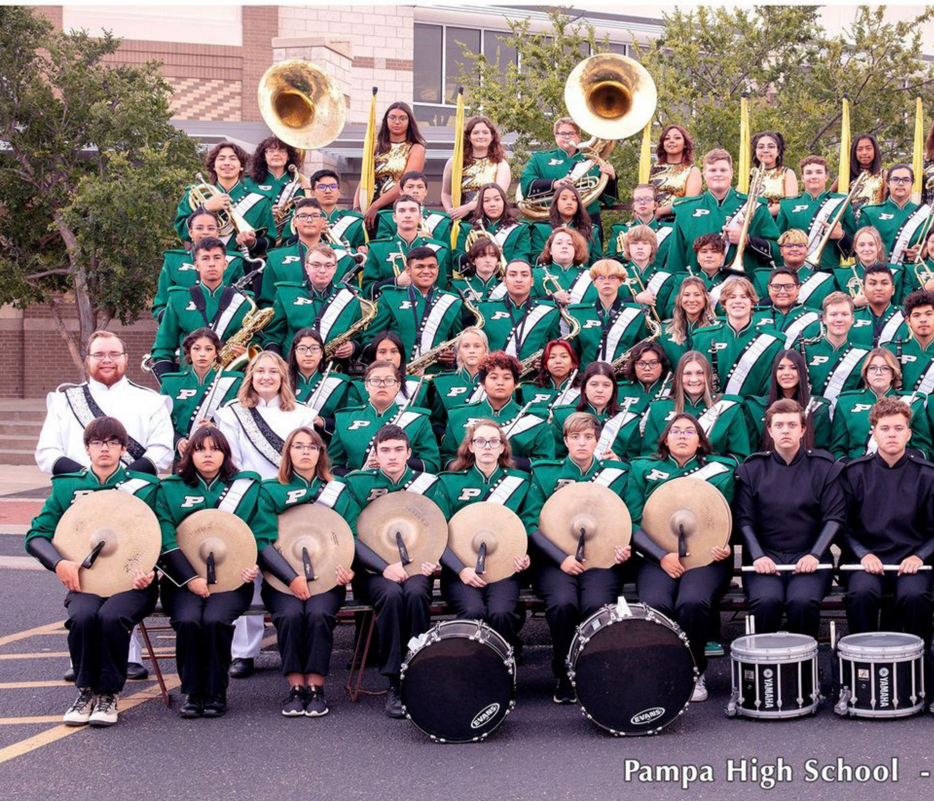
Pampa High School -