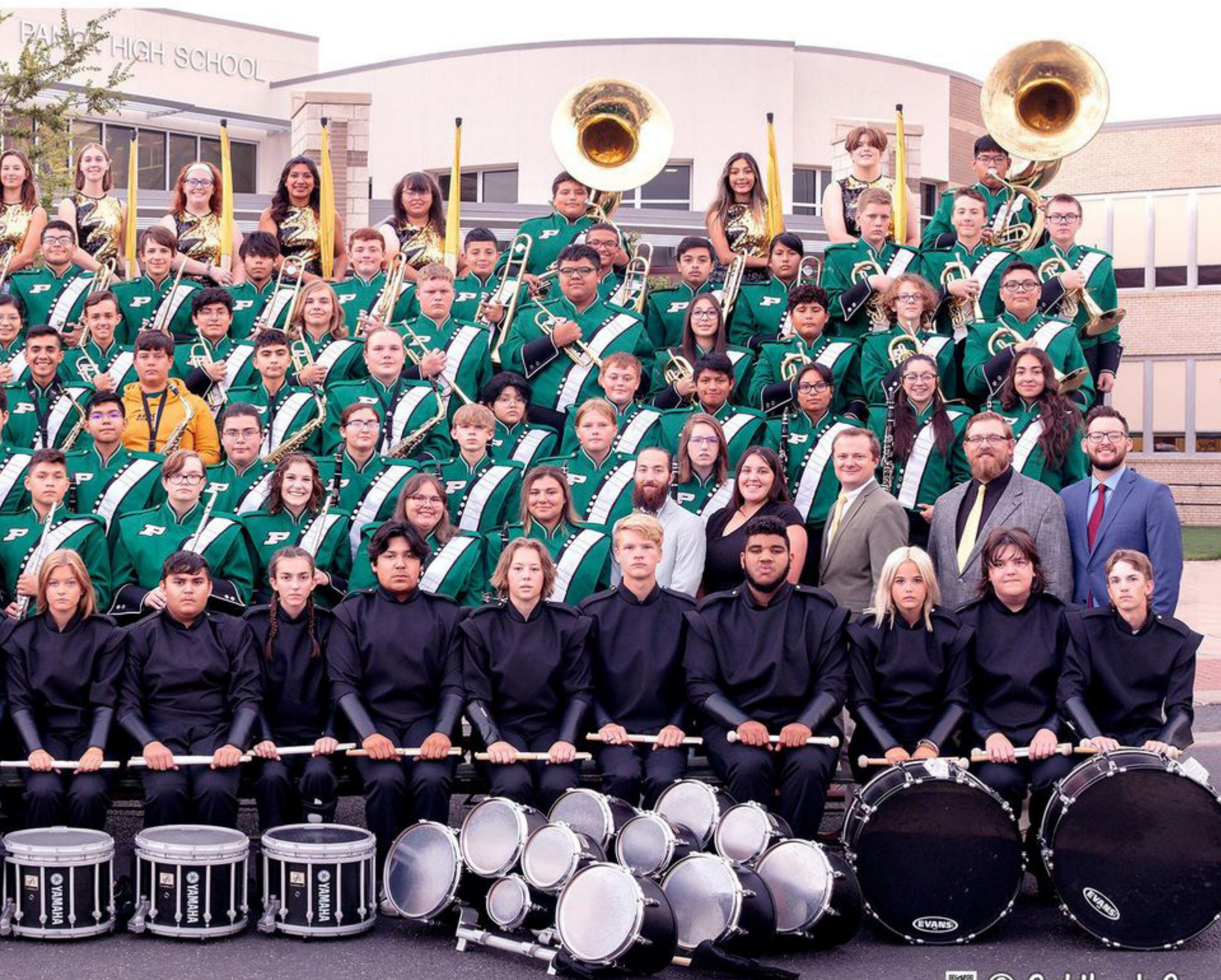
Band of 2021-2022