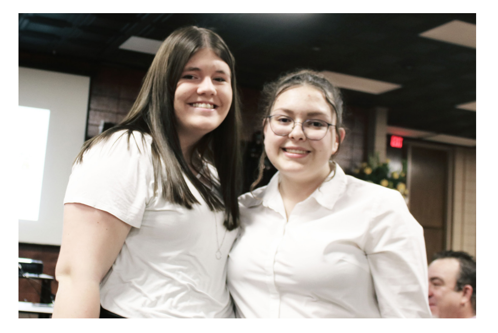
The 2022 Class of Pampa High School served dinner to the guests at the Pampa Chamber of Commerce banquet.