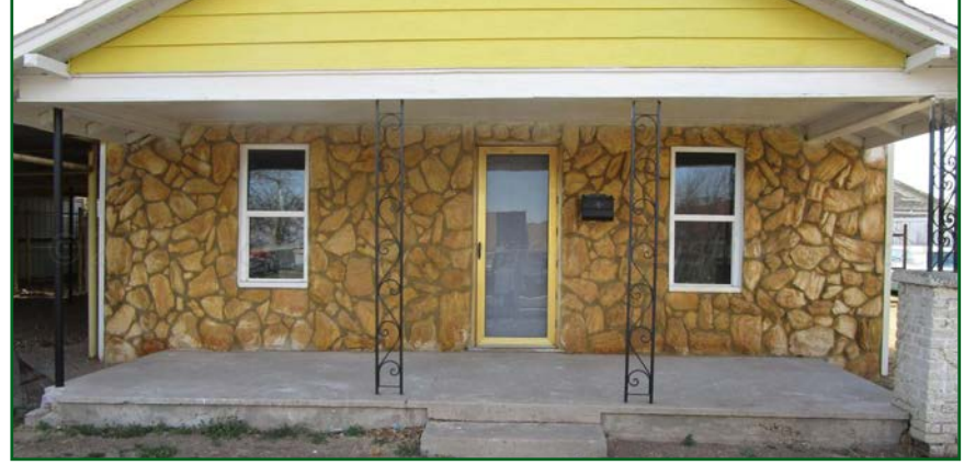
333 N Banks St - Pampa