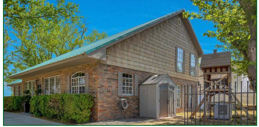
4800 Greenbelt Way Unit 20 - Clarendon