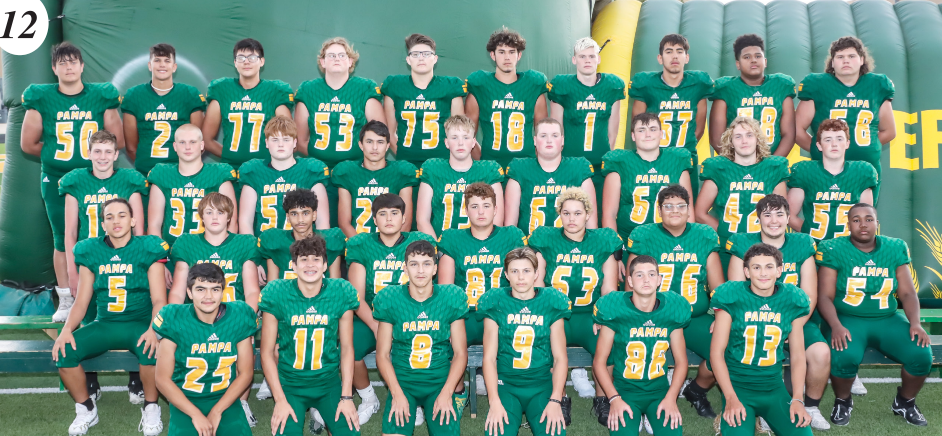
2022 Pampa Junior Varsity Team