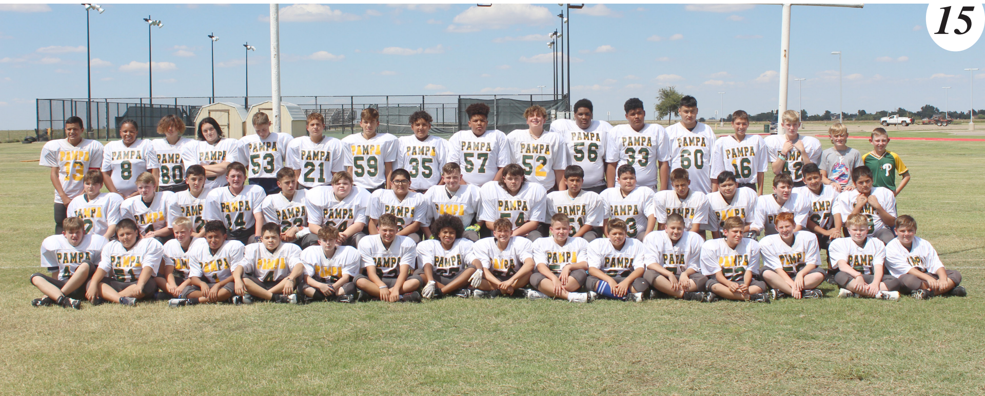
Pampa Junior High School 7th Grade Football Team