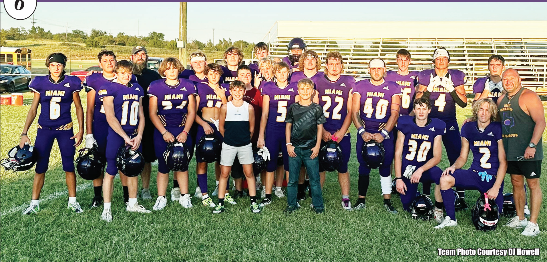
Team Photo