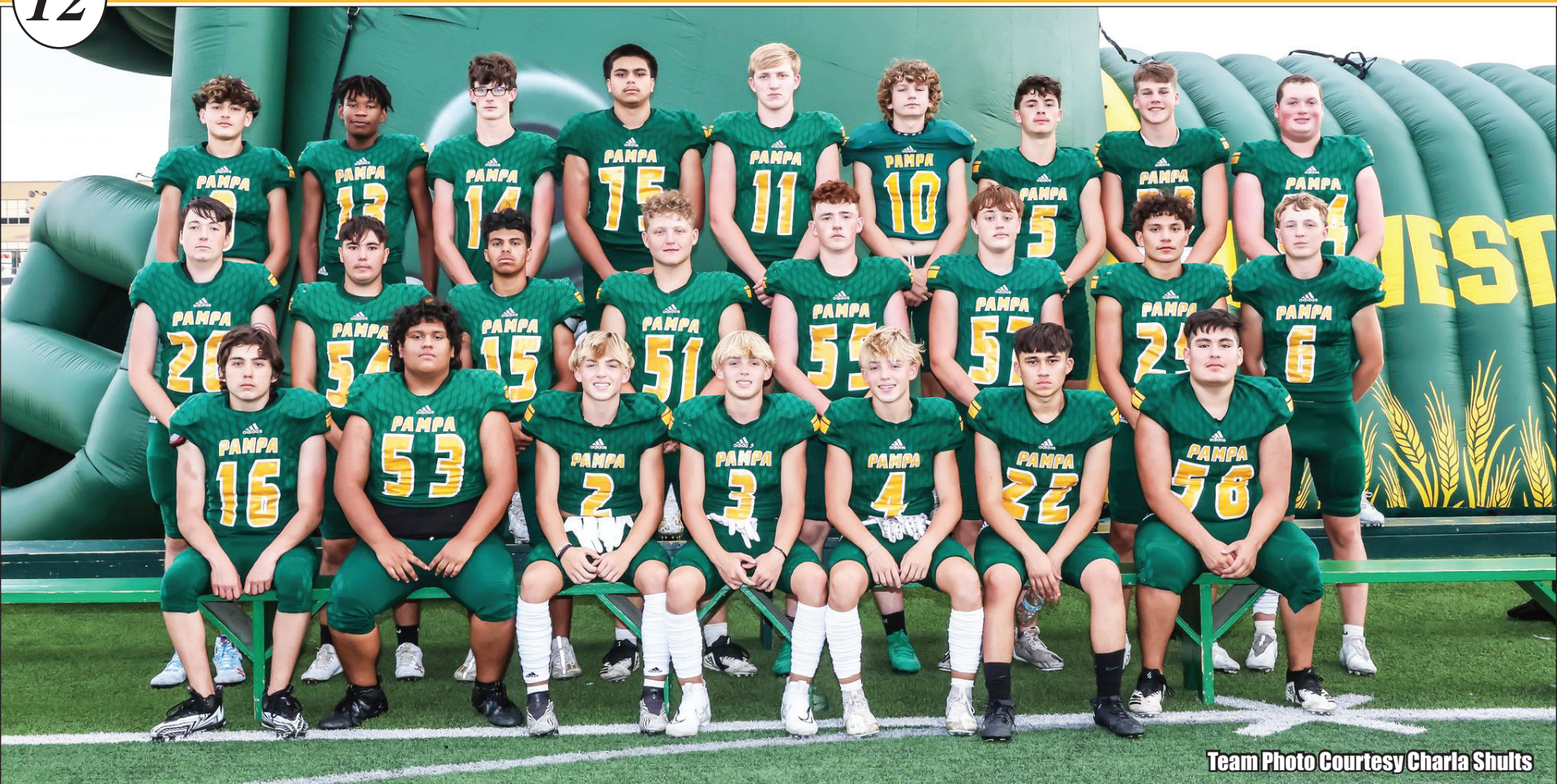
Team Photo Courtesy Charla Shults