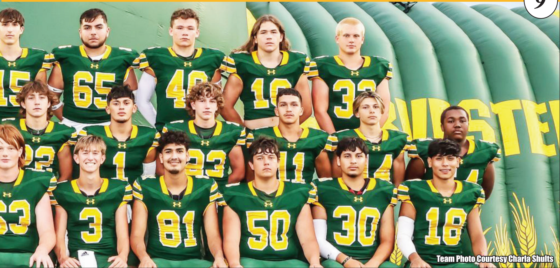
Team Photo