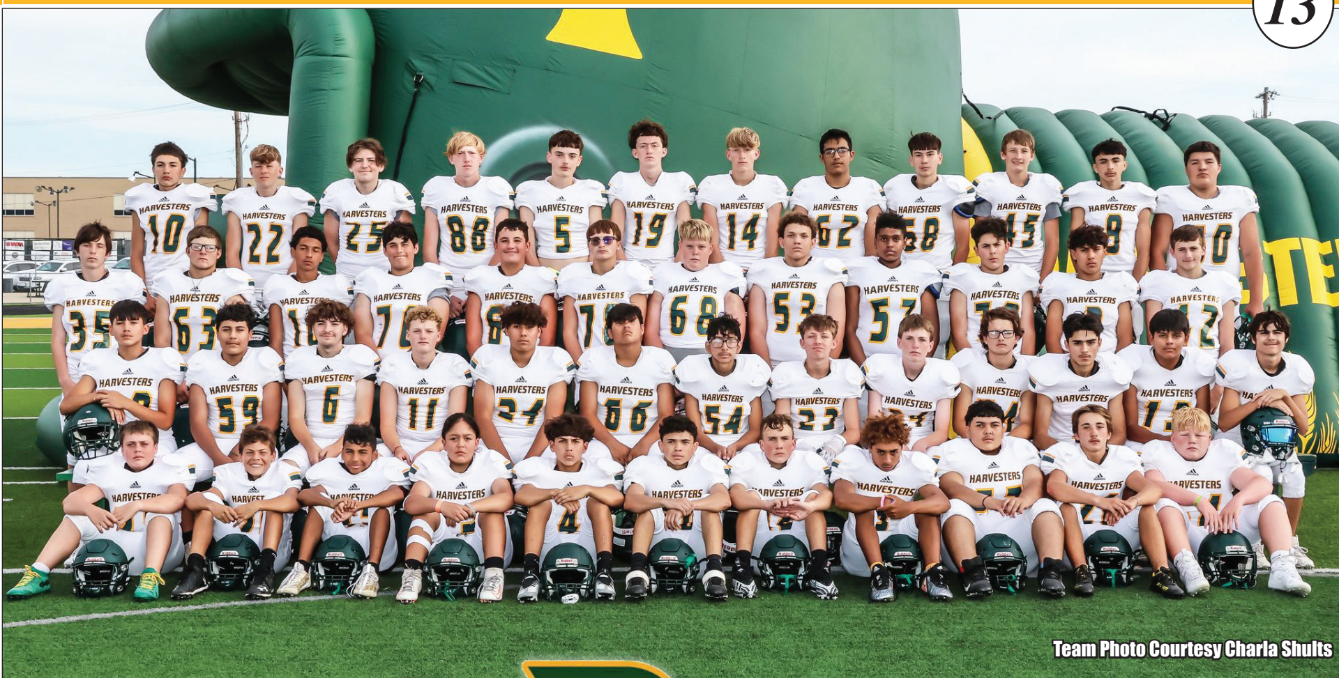
Team Photo