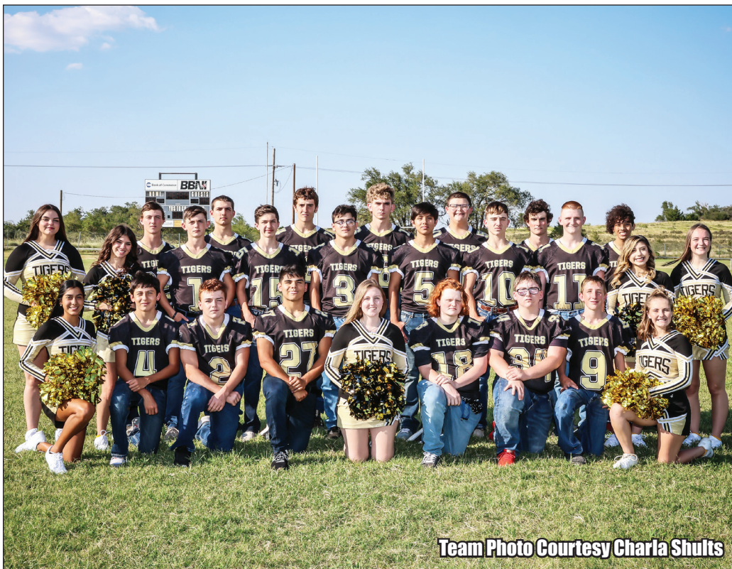
Team Photo Courtesy Charla Shults