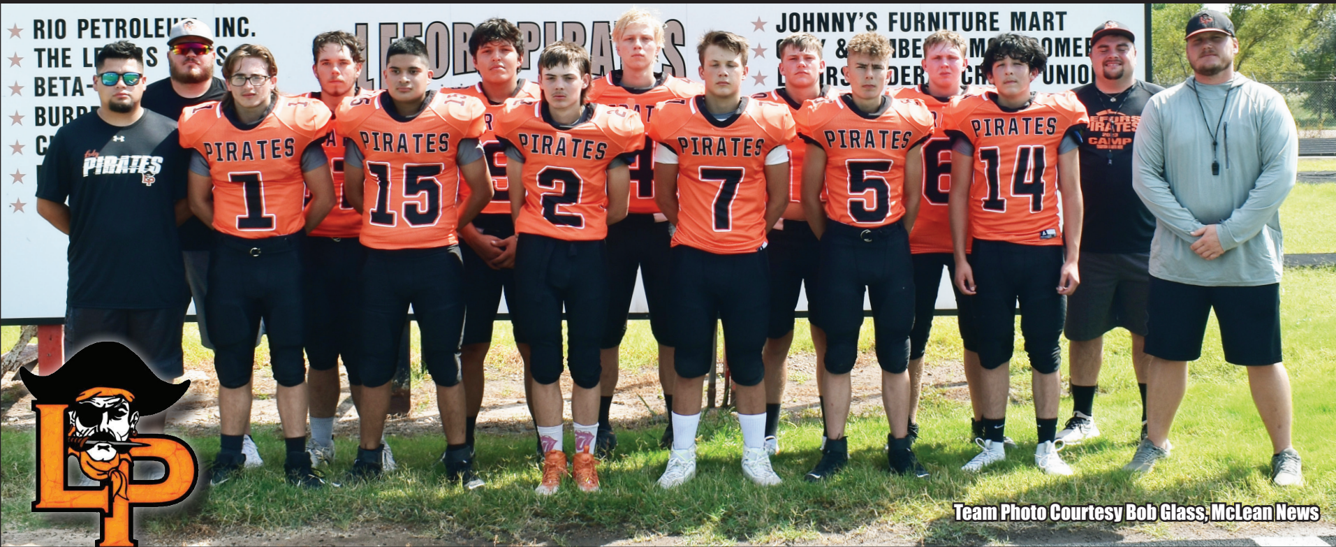
Team