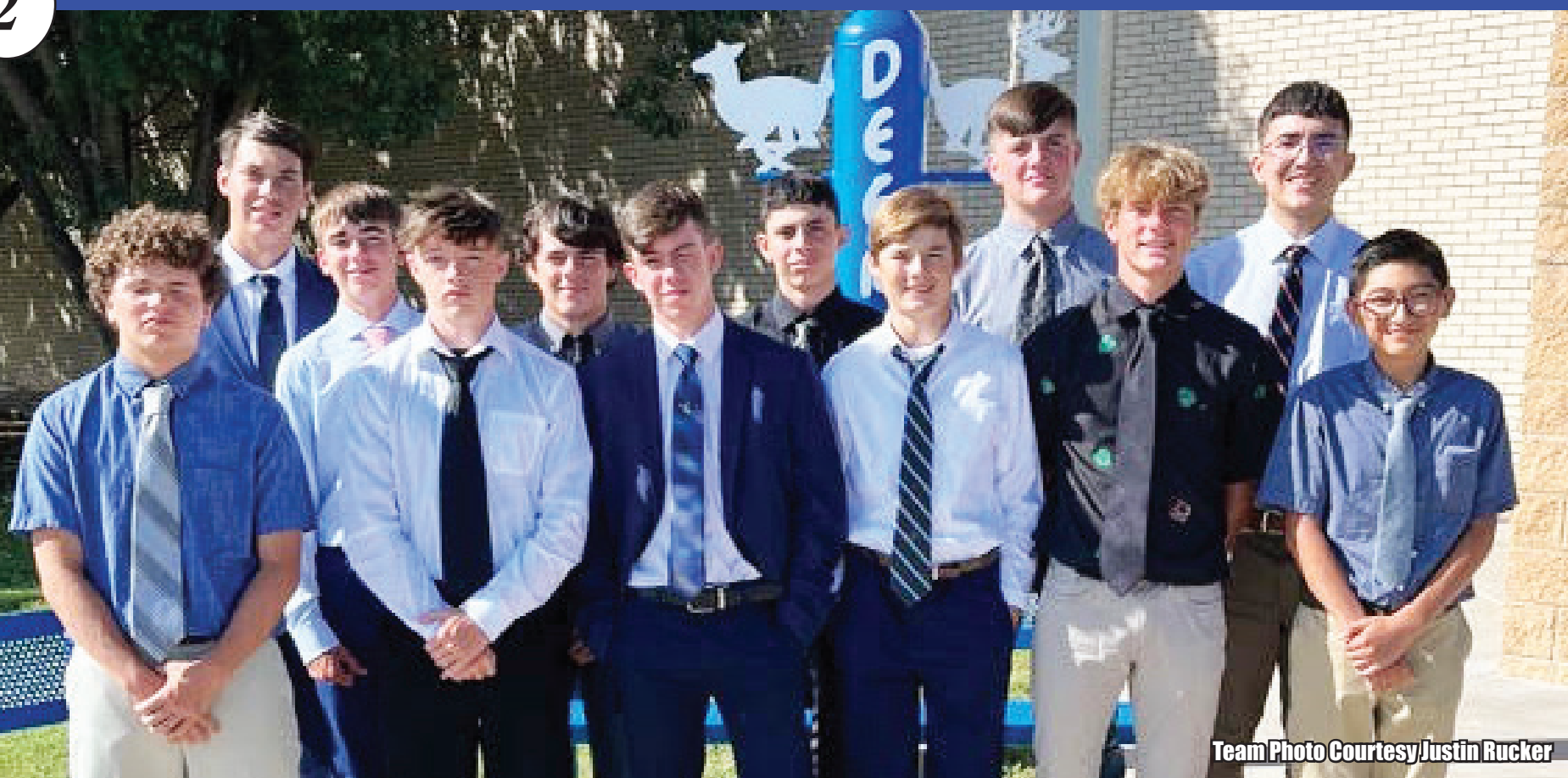
Team Photo