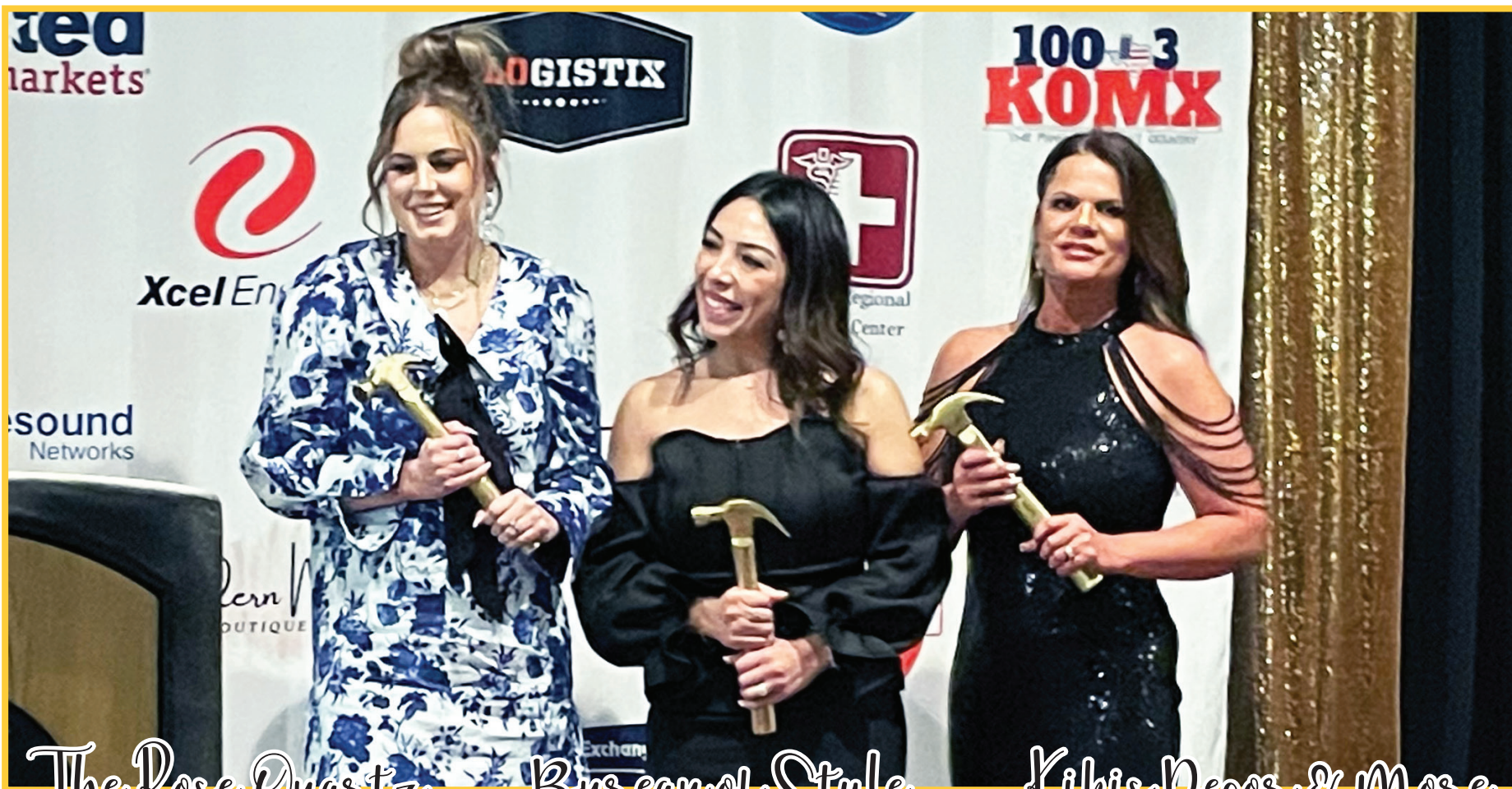
The Rose Quartz