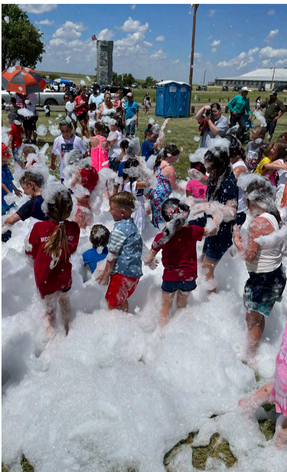
Fun in the Sun-and Suds