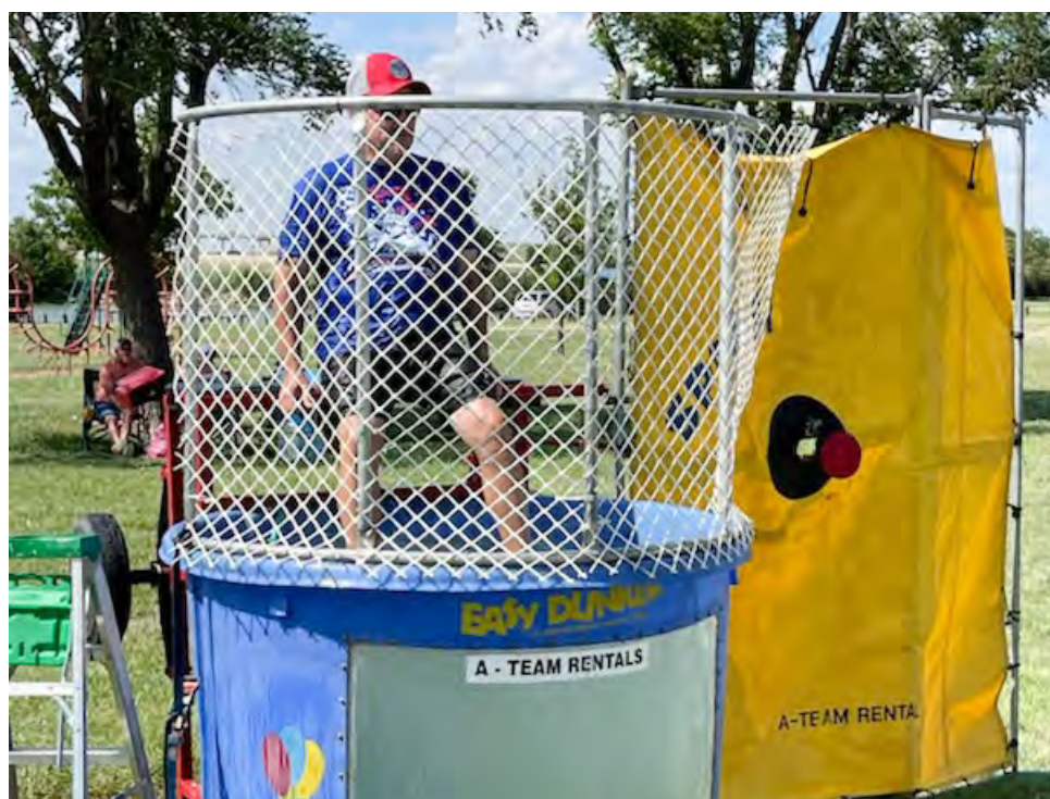
Dunking Booth (Submitted photo)