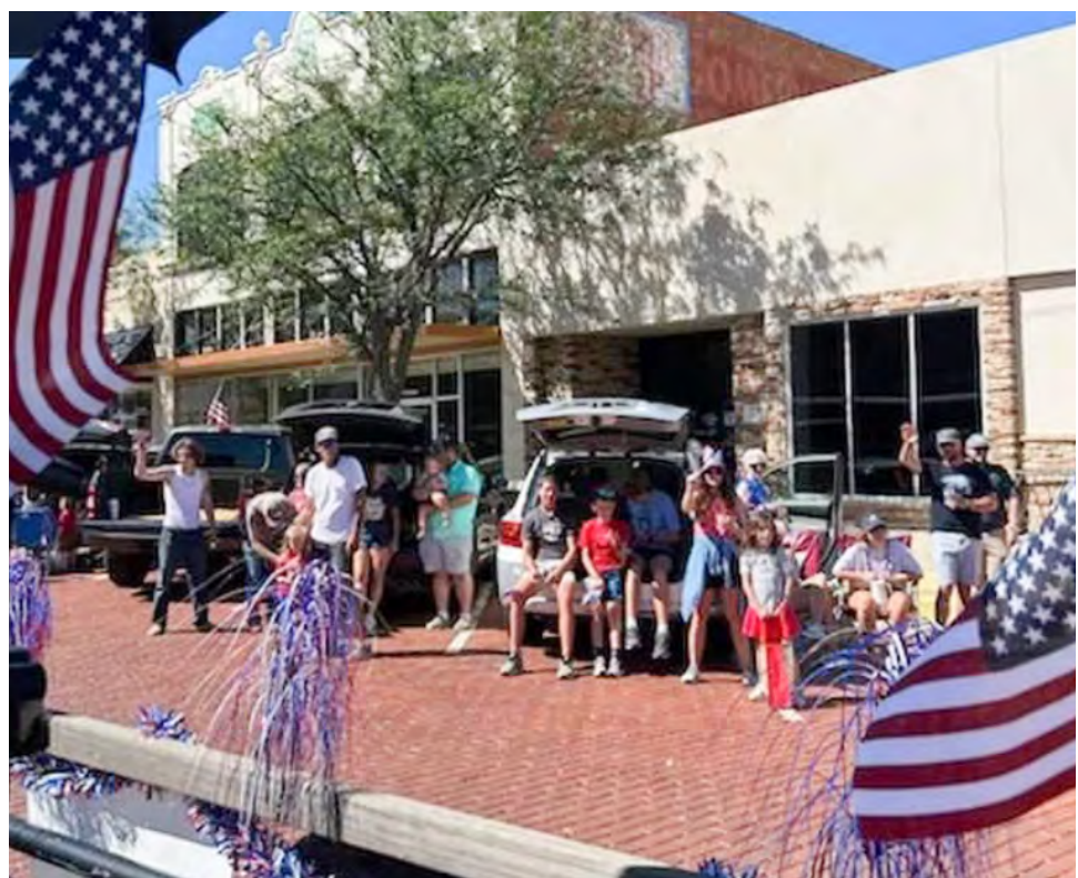
Spectators lined the streets of downtown to watch the Independence Day Parade (Submitted photo)