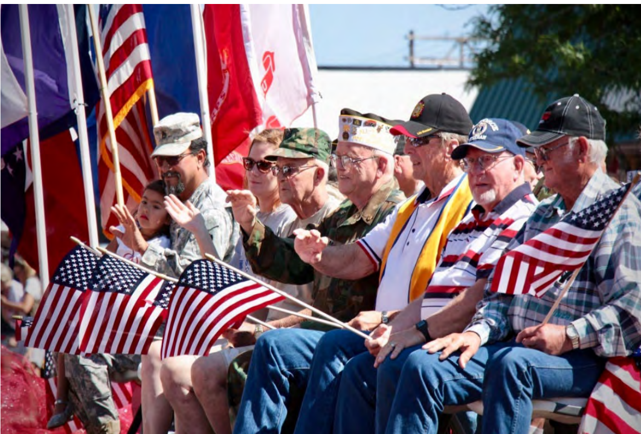
Veterans Float in the Independence Day Parade (Submitted photo)