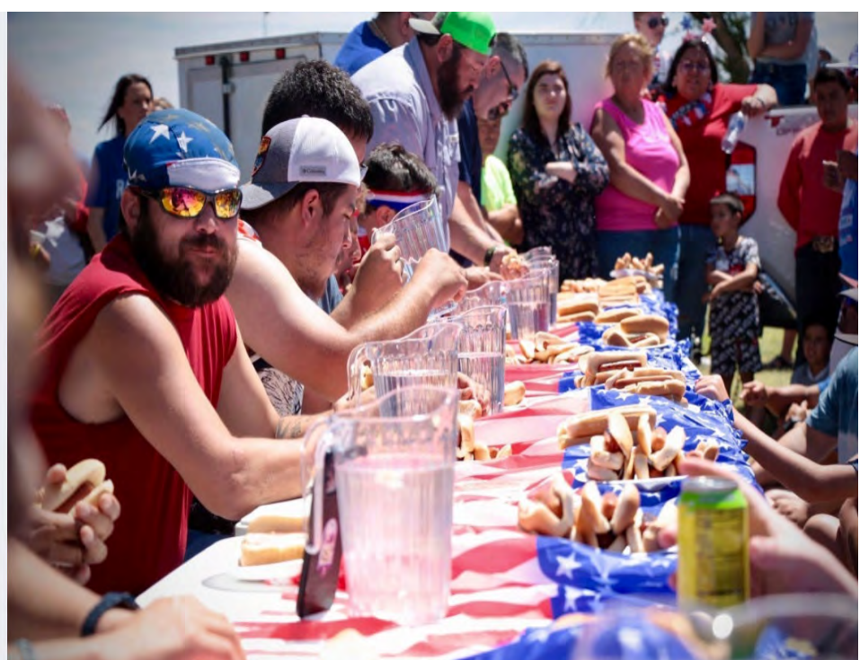
Hot Dog Eating Contest