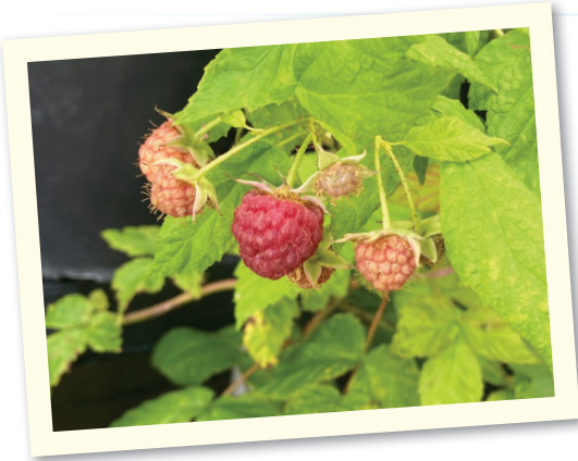
RASPBERRIES ARE ONE OF SEVERAL BERRY VARIETIES WHICH CAN BE PLANTED IN THE FALL.

will bloom through the winter somewhat, and will come on very early.”