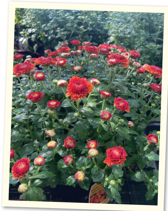
MUMS ARE A FALL OPTION FOR A BLOOMING PLANT.