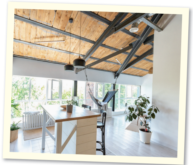
THERE ARE SEVERAL WAYS TO EITHER CONCEAL OR SHOWCASE BEAMS AND PIPES IN A HOME.

Whether you choose to camouflage or embellish the beams and pipes in your home, you can find everything you need at the stores in your area.