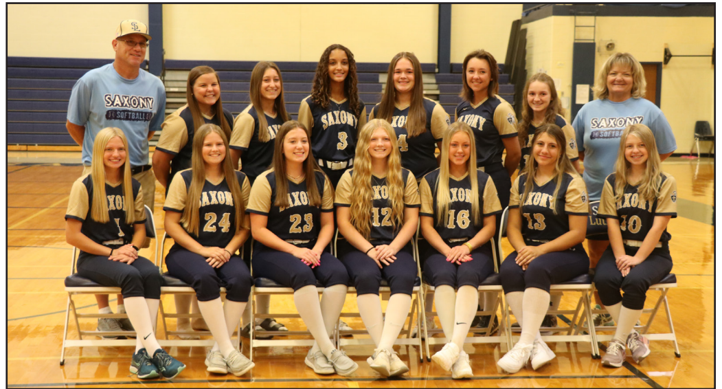
SAXONY LUTHERAN’S TEAM PHOTOS WILL NOT BE AVAILABLE AT TIME OF PRESS. THE ONLINE VERSION WILL BE UPDATED WITH TEAM PHOTOS.