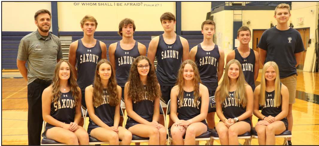
SAXONY LUTHERAN'S TEAM PHOTOS WILL NOT BE AVAILABLE AT TIME OF PRESS. THE ONLINE VERSION WILL BE UPDATED WITH TEAM PHOTOS.