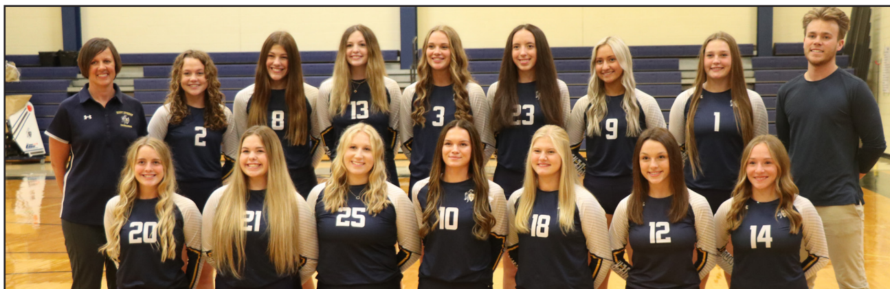
SAXONY LUTHERAN'S TEAM PHOTOS WILL NOT BE AVAILABLE AT TIME OF PRESS. THE ONLINE VERSION WILL BE UPDATED WITH TEAM PHOTOS.

To put it bluntly, Saxony Lutheran volleyball is looking to have another successful season.