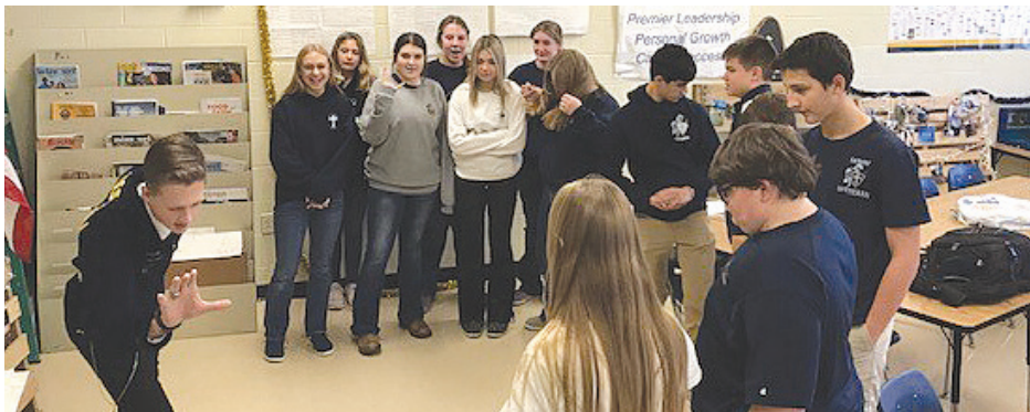
A state FFA officer visited our class talking about leadership and all the opportunities connected to the FFA

to live" is how hard cattle farmers are working to provide for families across the country. Earning to live is something I connect strongly to my SAE because raising beef cattle has taught me about hard work and it continues to teach me as I keep growing and learning by being involved in my SAE and agriculture community.