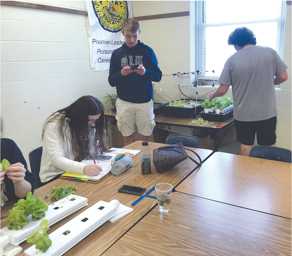
Inside our classroom we set up hydroponics units and explore the world of hydroponics with monetary

need hands-on experience to gain full knowledge. We have been around cows our whole lives and have seen everything from cows giving birth to watching them take their last breath. Raising cattle is an entire lifestyle and school can't teach the emotional attachments you get with them. Cattle are something we will probably be around the rest of our lives, and they will continue to teach us new things and give us more experiences every day.