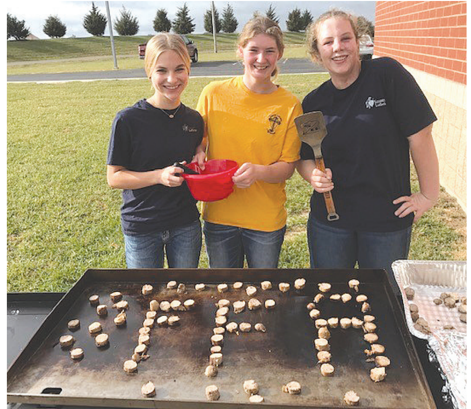
Students prepare another breakfast food during one of the Saxony FFA functions where we cook

munity, teachers, and veterans. We also help out with other community events like taking care of trash at Jackson Backyard Barbeque and grilling hamburgers and porkburgers at Old Timers Day in Perryville. It doesn't matter what we're helping out doing, as long as we're doing it with fellow members we all have a good time and "Live to Serve".