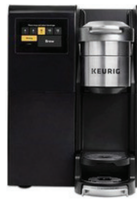
K3500 Brewer Receive FREE 9 boxes

Designed for large offices. Ideal for breakrooms and for businesses with 30 or more employees.