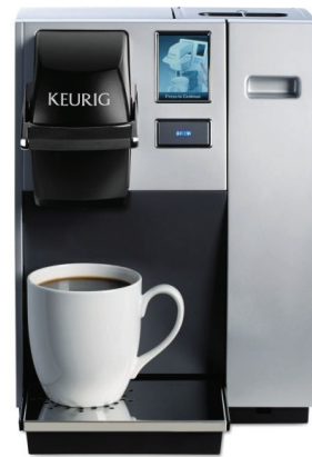
K150P-Plumbed K150-Pourover Receive FREE 6 boxes

Medium office brewer - all the features to serve businesses with 15-30 employees.