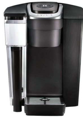
K1500 Brewer Receive FREE 5 boxes

Small office brewer - a mainstay for businesses with less than 20 employees.