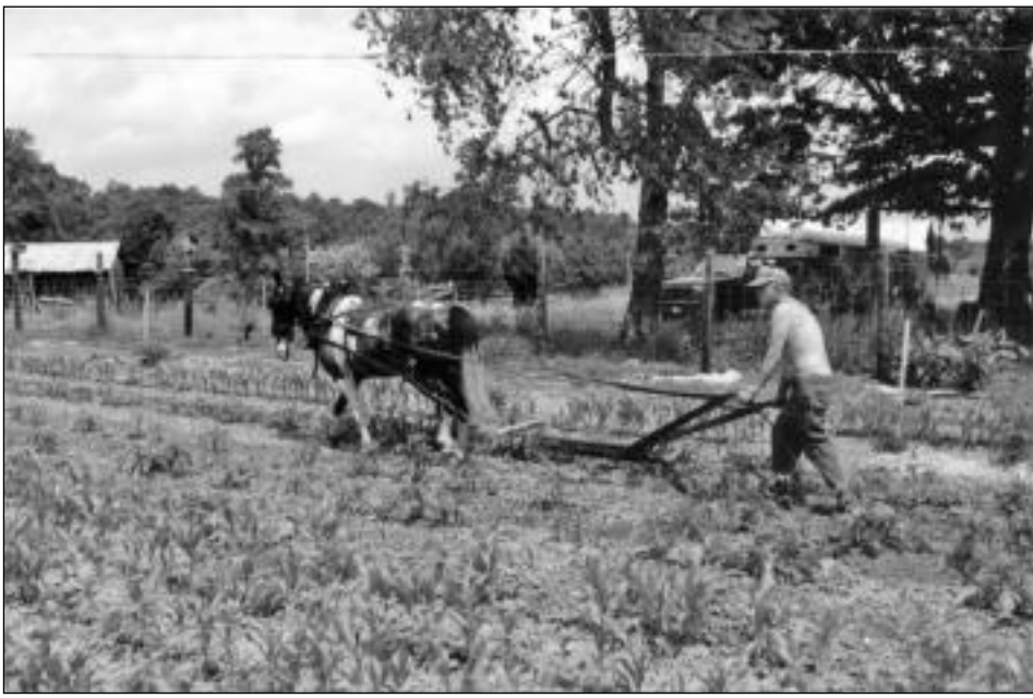
Bill Mosley and Star still raise vegetables the old-time way. Were we better off economically then or now?

2400 Hwy. 13 N • Waverly, TN • 931-296-2437 9729 Hwy. 70 E • McEwen, TN • 931-582-6271 Obituary Line 931-296-3500 • www.luffbowen.com