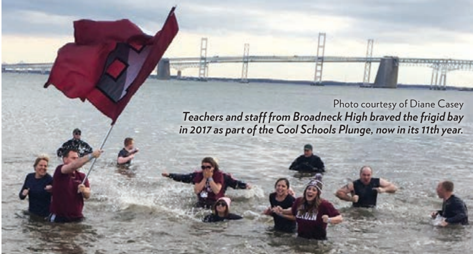
Teachers and staff from Broadneck High braved the frigid bay in 2017 as part of the Cool Schools Plunge, now in its 11th year.