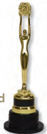
2019 Grand Centurion Award Winner

#1 CENTURY 21 Team in Maryland and #16 in the United States