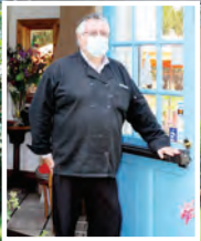
Victor Welcomes You!

Come see all the improvements we've made... and the favorites we've kept!