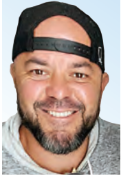
Gary Whittington Worldwide Concrete

C ooler temperatures are approaching and with that comes snow and ice. Harsh elements and freezing temperatures often call