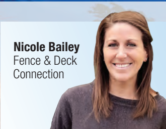
Nicole Bailey Fence & Deck Connection

retreat just steps from your door! Whether you have a fenced-in backyard or a spacious deck, consider the following tips on transitioning your outdoor space from summer sanctuary to an autumn oasis.